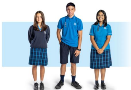
Year 9-11 Uniform