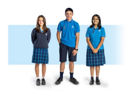
Year 9-11 Uniform